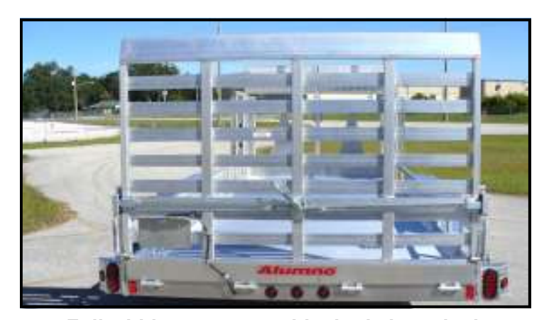
Full width ramp gate with single lever lock

Alumne is a leader for Aluminum Trailers in the green industry. Our trailers are made from high-quality, corrosion-resistant Aluminum Extrusion specifically designed to be lighter, stronger, and more durable. With fuel cost going higher every day the Alumne Lawn Maintenance Trailer is the ultimate solution for lawn maintenance contractors. It has an all aluminum frame structure, increasing pay load, eliminating preventive maintenance and maintaining its value. The entire trailer can be cleaned with pressure washing. All lighting is LED and the electrical system is sealed. By combining these innovative techniques along with proprietary Alumne extrusions, Alumne has created the best trailers in the industry.