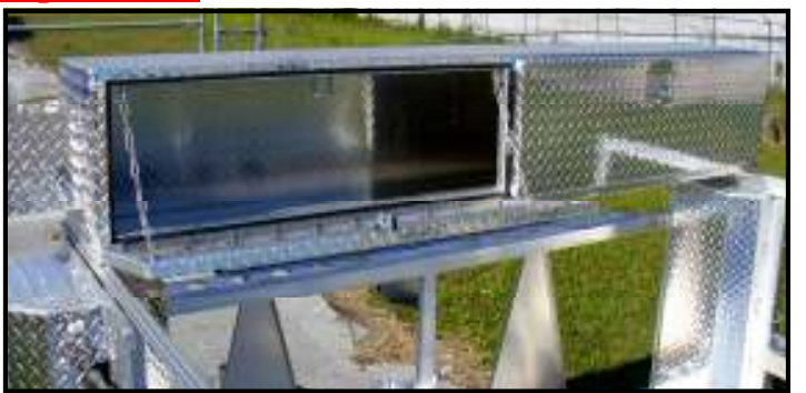
Top mount tool box