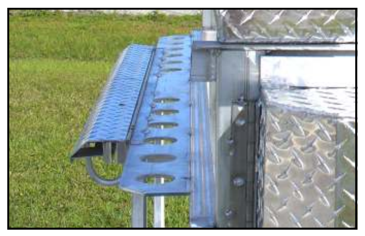
Shovel & rack rack