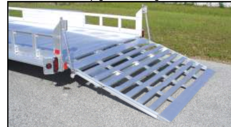
Extruded non slip gate surface with spring assist