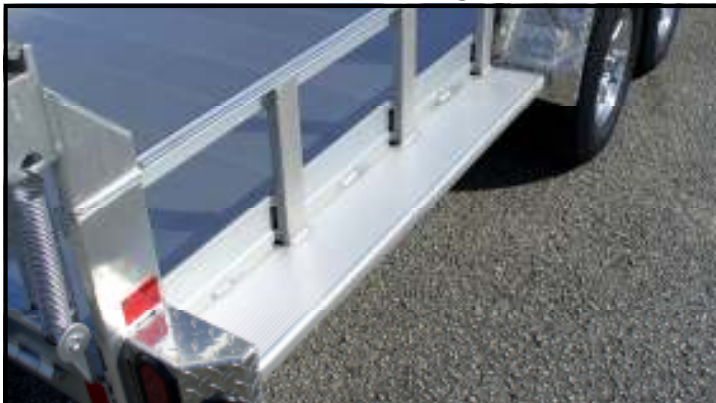
Extruded non skid running board rear