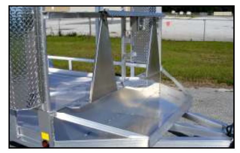
Open storage box water cooler & back pack rack