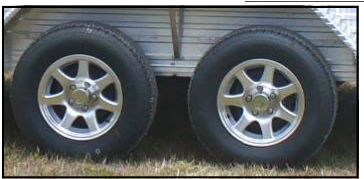
Optional aluminum spoke wheels