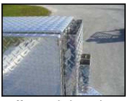
Mower and edger rack