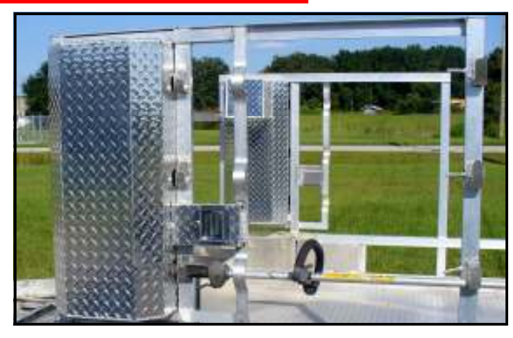
Locking side trimmer racks