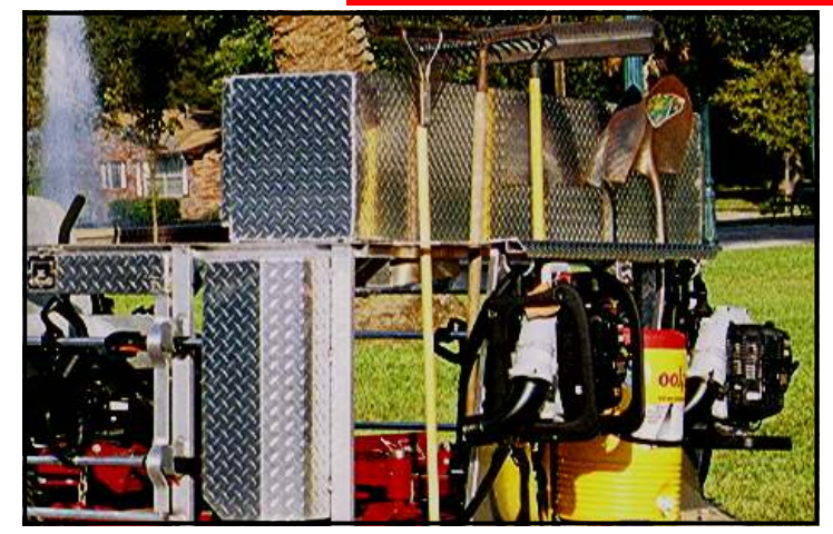
Locking tool rack on front of rack for 2 back pack