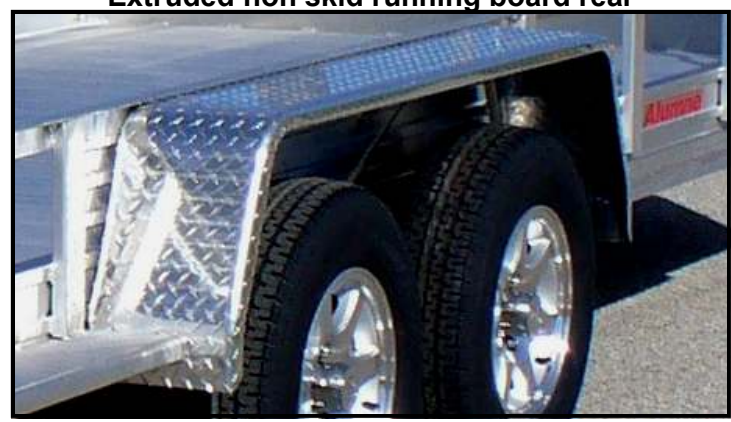
Tread plate heavy gage fenders

Alumne is a leader for Aluminum Trailers in the green industry. Our trailers are made from high-quality, corrosion-resistant Aluminum Extrusion specifically designed to be lighter, stronger, and more durable. With fuel cost going higher every day the Alumne Lawn Maintenance Trailer is the ultimate solution for lawn maintenance contractors. It has an all aluminum frame structure, increasing pay load, eliminating preventive maintenance and maintaining its value. The entire trailer can be cleaned with pressure washing. All lighting is LED and the electrical system is sealed. By combining these innovative techniques along with proprietary Alumne extrusions, Alumne has created the best trailers in the industry.