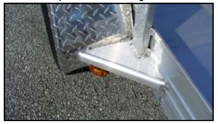
Extruded non skid running board front