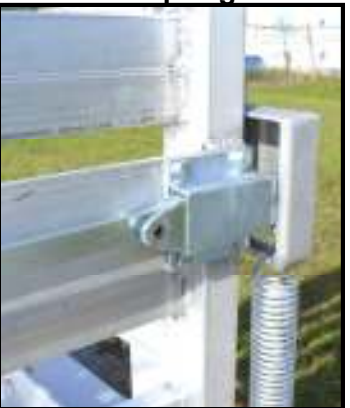
Ramp gate deadbolt & lever lock